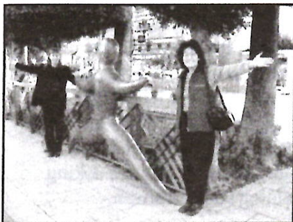
KIDS EE logos were dancing in the park across from the church, much to everyone's delight!