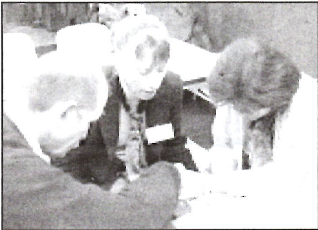
The U.S. team knows that success depends on prayer.