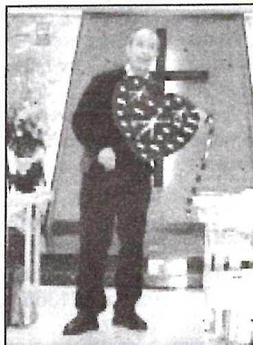
Man can't be perfect because his heart is chained with sin. The Bible says, "For all have sinned and fall short of the Glory of God." Romans 3:23