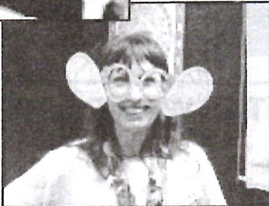
Big ears and glasses are made so that we remember to LISTEN and LOOK at what God says in Scripture, what we say to each other, and to what the children are saying to us.