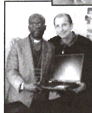
Dioceses computer will advance church's work. KIDS EE clinician armed with new Bible (Top).