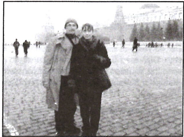
The Warrens in Red Square