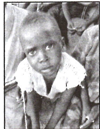
Your Support and Prayers Help Us HelpThem!