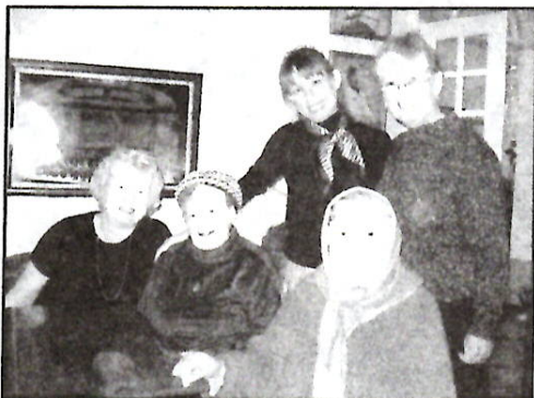
Two of the Babuska Brigade