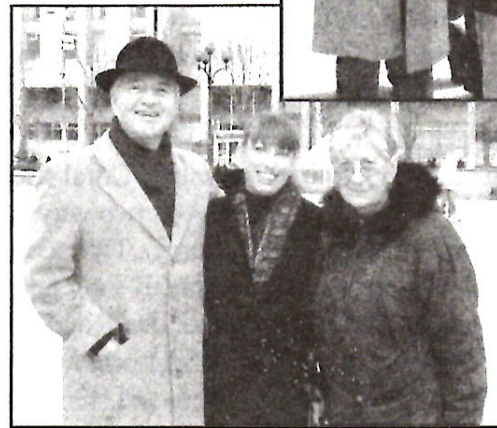
Checking out expansion plan sites