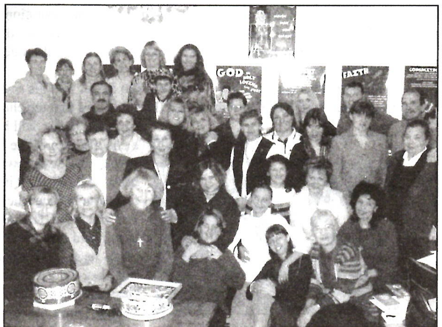
KIEV KIDS EE CLINIC