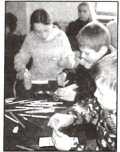
Kiev Kids and Gospel Crafts