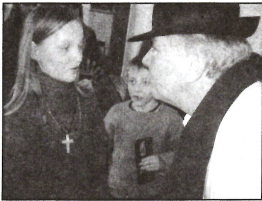
The children know that he loves them.