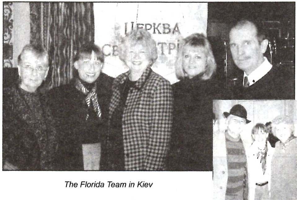
The Florida Team in Kiev

Requests continue for Evangelism Training in 2003. With your help we can train others in the exciting and effective ministry of Evangelism Explosion. We continue to look to the Lord as He leads you to help us through your prayers and support.